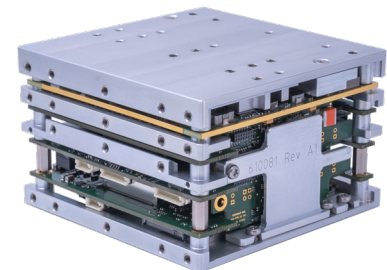
Unibap SpaceCloud™ iX10 photographs. Quad core (8 thread) x86-64 CPU and AMD Radeon GPU paired with SATA and NVMe SSD storage, Microsemi PolarFire FPGA and optional mini PCIe (mPCIe) AI processing accelerator (e.g. Intel Movidius Myriad X VPU).