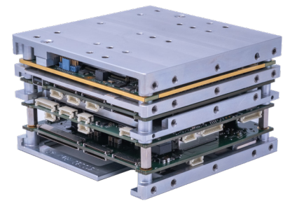
Unibap SpaceCloud™ iX10 solution PCBA. COM Express Compact form factor derived: 95 x 95 x 45 mm 3 with PC/104 stackable mounting holes.

Whether you have a Space Domain Awareness (SDA) payload, an Earth Observation (EO) payload, a synthetic aperture radar (SAR) payload, robotics, or any other situation where intelligent data processing is needed, the iX10 provides unique value through its massively parallel architecture and machine learning support.